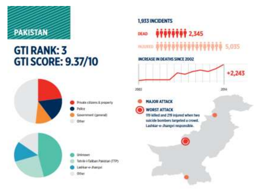
Figure – 2

The statistics of year 2014 present a positive trend in terms of security situation, as there was decrease in incidents of violence. The number of terrorist attacks came down by 30 per cent as compared to 2013.<sup>39</sup>