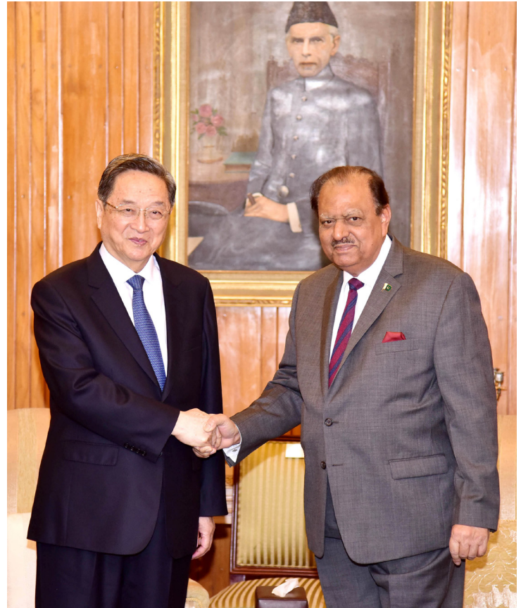
President Mamnoon Hussain welcoming Yu Zhengsheng, Chairman of National Committee of Chinese People's Political Consultative Conference (CPPCC) upon his arrival at Aiwan-e-Sadr, Islamabad on April 6, 2017.