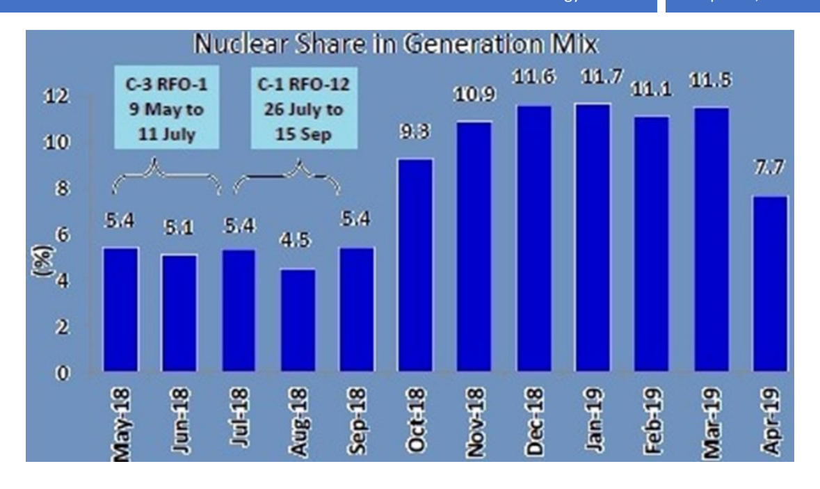
Source: "Nuclear Power Plant - Facts & Figure," Pakistan Atomic Energy Commission(PAEC), <a href="http://www.paec.gov.pk/Parameters/">http://www.paec.gov.pk/Parameters/</a>

According to the PAEC statement, the K-2 nuclear power plant (NPP) had achieved criticality at the end of February 2021 and had been undergoing safety tests and procedures. The loading of nuclear fuel onto the plant was earlier done in December 2020, after clearance from the Pakistan Nuclear Regulatory Authority (PNRA). The PAEC further said that K-2 is a pressurised water reactor based on the Chinese ACP1000 technology and a third-generation plant with advanced safety features. The K-2 would be the NPP with the highest power generation capacity of 1,100MWe compared to just 1400MWe from the five PAEC operated nuclear plants combined. The PAEC stated that this addition would "help improve the economy of the country." There is one more power plant under construction of the same series in Karachi known as K-3 that will be completed and become operational by the end of the year. This would further add to the national grid.