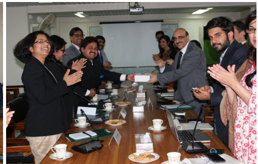
March 19, 2015: An in-house meeting with five Indian Trainee Officers of Ministry of External Affairs.