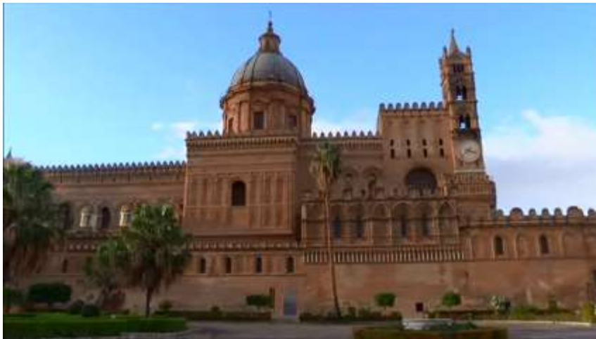
Central Mosque of Sicily

Though there were times when relations among different faith followers were not ideal, but they lived and prospered together. It was the period of Renaissance.