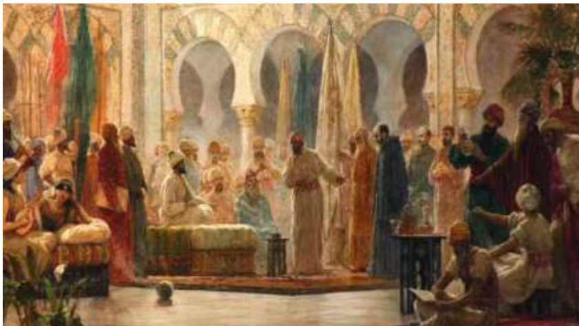
Scene from the film depicting past of Muslims in Europe

The personalities interviewed in the film are from diverse religious and political backgrounds, social activists, some with biases against Islam and others seeking peaceful coexistence and harmony among all faith believers. At present, many say that Islam and European identity are incompatible or Islam has contributed nothing to Western civilization and there are others who are of the opinion that Islam is part of Europe.