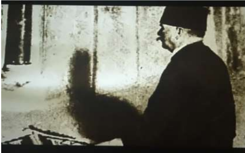
Allama Iqbal at the Grand Mosque of Cordoba

The story of Islam in Europe came to an end with the Fall of Grenada — Spain in 1492 AD. Over the next few centuries, Spain tried to erase every sign of Islam but Muslims' influence remained even after the Fall. Centuries later Islam still exists in Europe, but that period left behind the idea of La Convivencia — a Spanish term — that means people could live together, they could coexist and this idea is desperately needed in the current times. The documentary also illustrates the role of Christian rulers in Sicily, Roger II and Frederic II, the Holy Roman emperors, who spoke Arabic, had Arabic guards and had Arabic inscription on their royal mantles. So the Convivencia in Sicily is in reverse, i.e. the Christian rulers were highly appreciative of the Muslim culture and contributions.