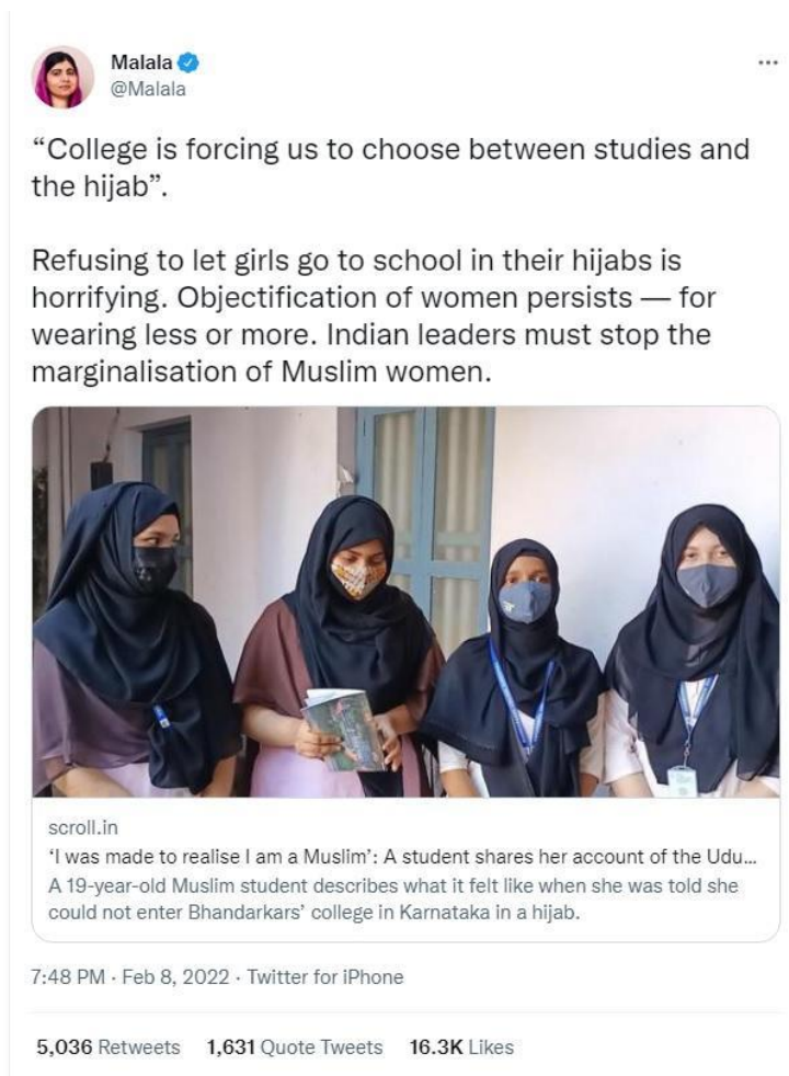
Figure 2: Pakistani activist Malala Yousafzai tweeted. 4