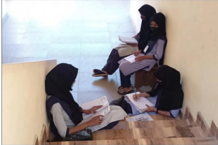
Figure 1: “The photo of the girls sitting on the stairs of the college that went viral on social media.” 2

teacher immediately shouted at them: “Get out.” 1 The latter incident clearly reveals a certain level of hatred. Barring students from entering the classroom and making such derogatory comments are not justifiable in the name of “social harmony.”